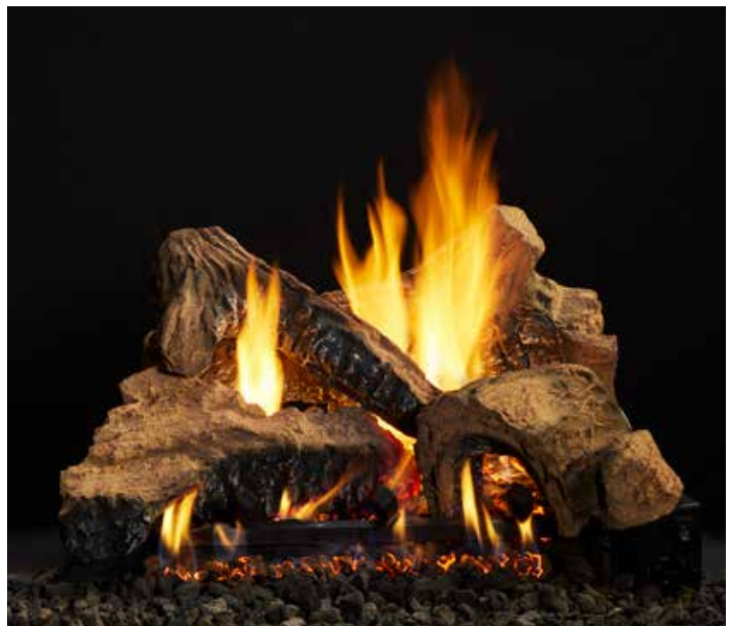
Duzy 2 - 24" Log Set