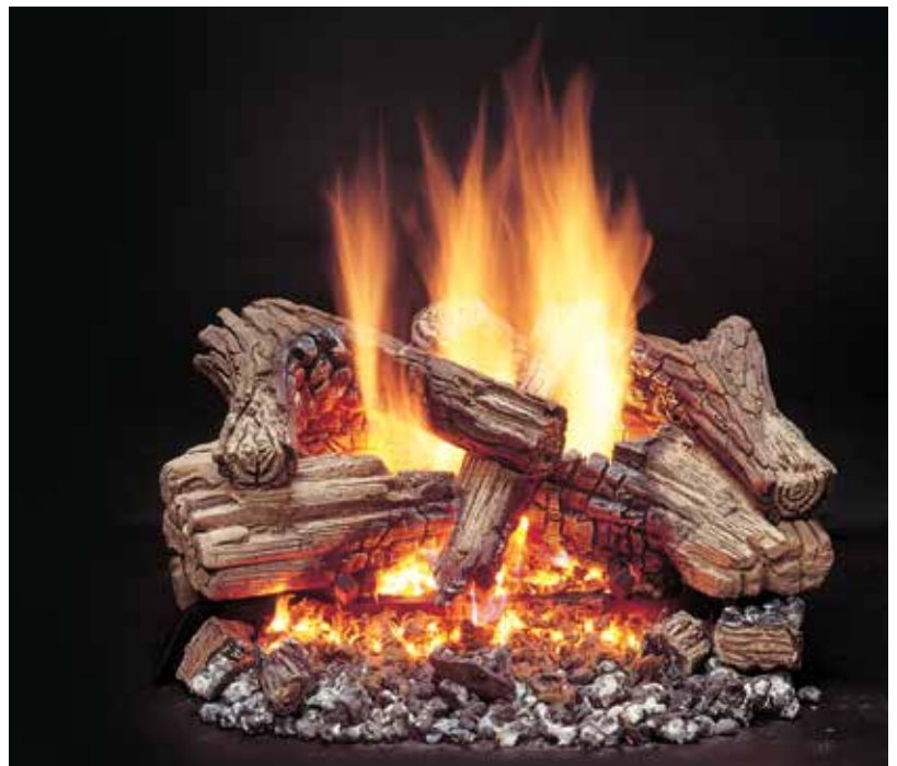
Duzy 3 - 24" Log Set