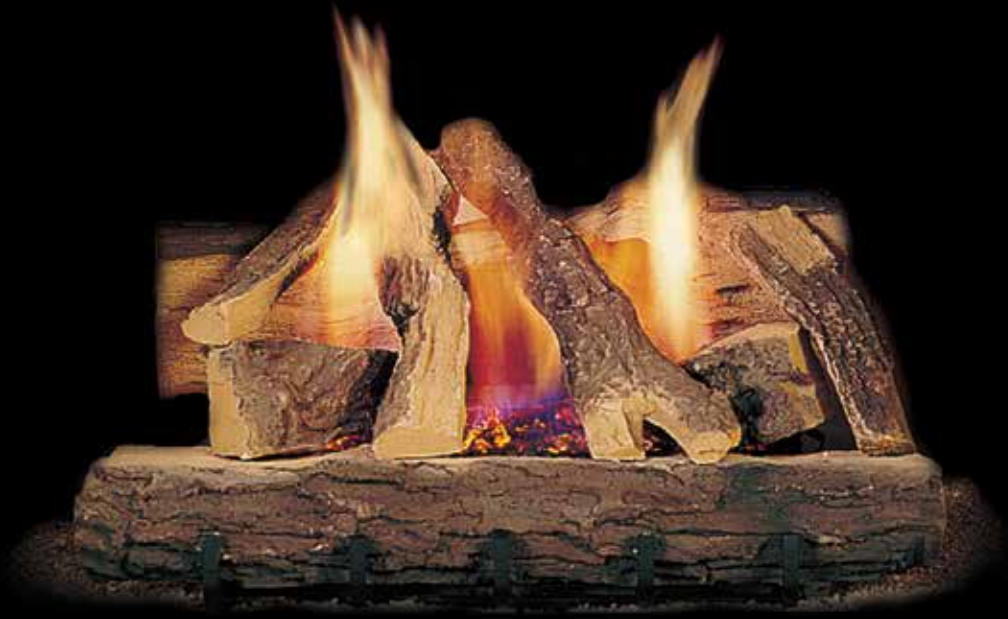
Campfire - 30" Log Set