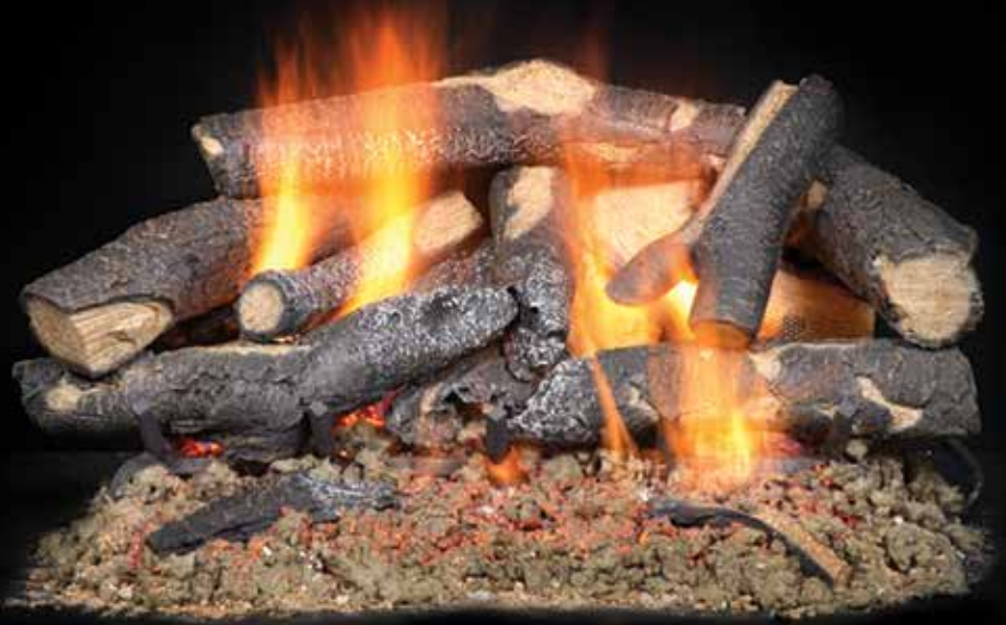
Fireside Supreme Oak - 30" Log Set

For a charred, mature fire, the 12-log Fireside Supreme Oak gas log set is stunningly realistic yet affordable. The detailed concrete logs, molded from real oak, are attractive even when not burning—also in a See-Through model that looks great from either side. In the Duzy 3, durable, glowing logs are convincing while radiant heat technology distributes penetrating warmth with no fan needed.