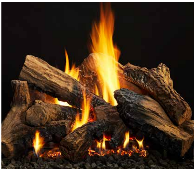
Duzy 5 - 24" Log Set