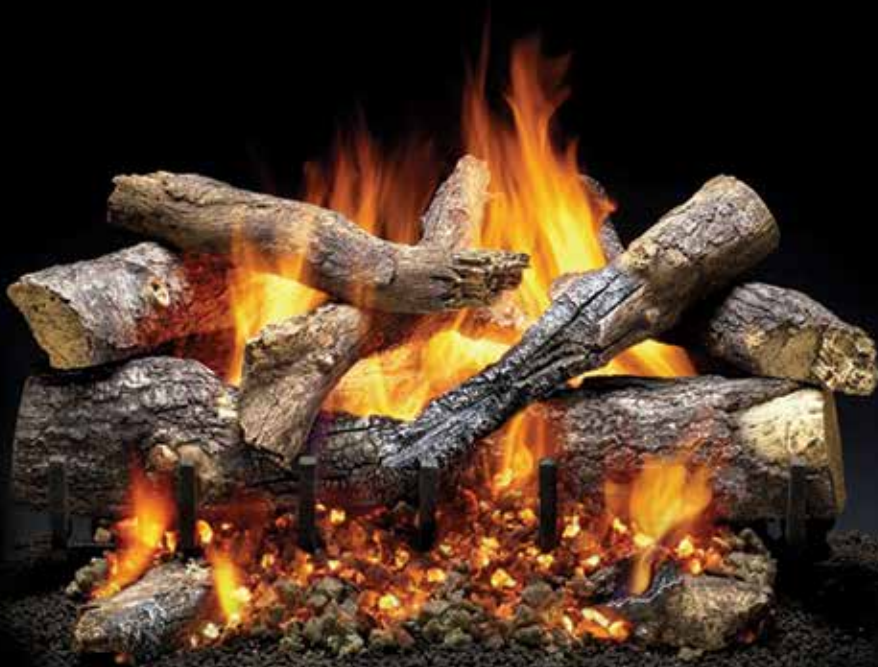
Grand Oak 24" 2-Tier Log Set

For larger fireplaces, the Fireside Grand Oak vented gas log set showcases 11-12 authentic logs from real oak timber molds. An ultramodern burner system creates a multi-level fire. The Outdoor version has such a beautiful fire, friends may ask if they can add a log to it. For gas logs with radiant burner technology, add outstanding realism with the Duzy 5's eight true-to-life ceramic logs, pushbutton ease and Natural Flame™ look.