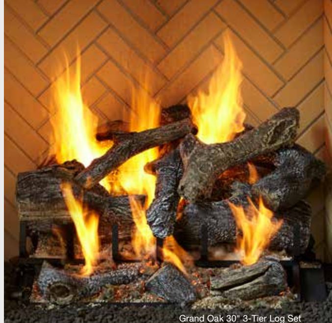
Grand Oak 30' 3-Tier Log Set

You get the look of a traditional, open-hearth fireplace plus the cleanness of gas with touch control. A gas log set doesn't overheat the room or require any change in the appearance or structure of your fireplace. Instead it delivers a realistic, room-enhancing fire at any moment, any day of the year.