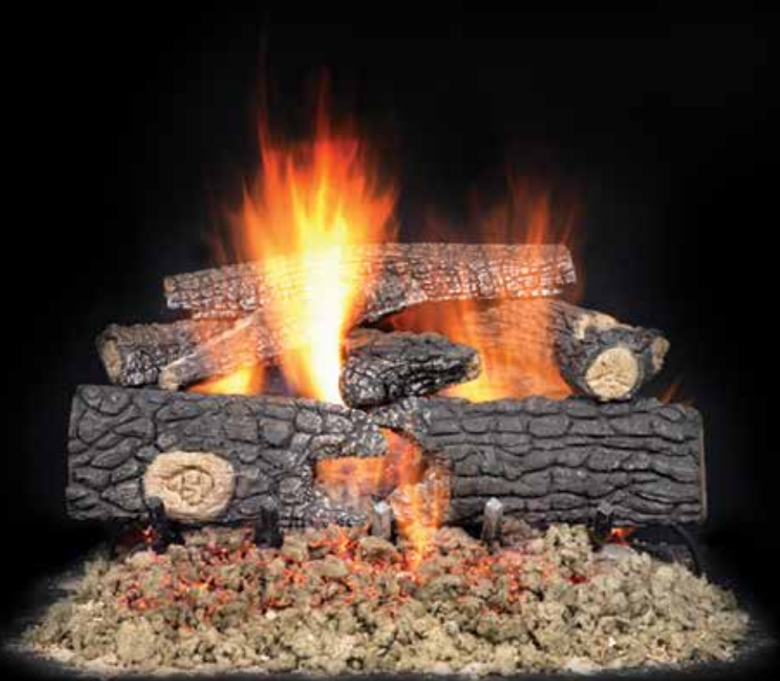
Fireside Realwood - 24" Log Set

Beautiful logs create a beautiful fire, but they don't have cost a lot. The Fireside Realwood gas log set adds bona fide appearance with eight detailed logs at a value price. An Outdoor model features a stainless-steel grate and burner elements to handle the elements. The Duzy 2 fits even narrow wood-burning fireplaces with four ceramic-fiber logs and our patented Natural Flame stainless steel burner, while the Campfire set recreates a natural look with 10-11 ceramic fiber logs.